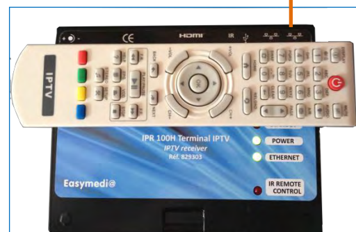
STB WiMy HD IPTV decoder & the remote control