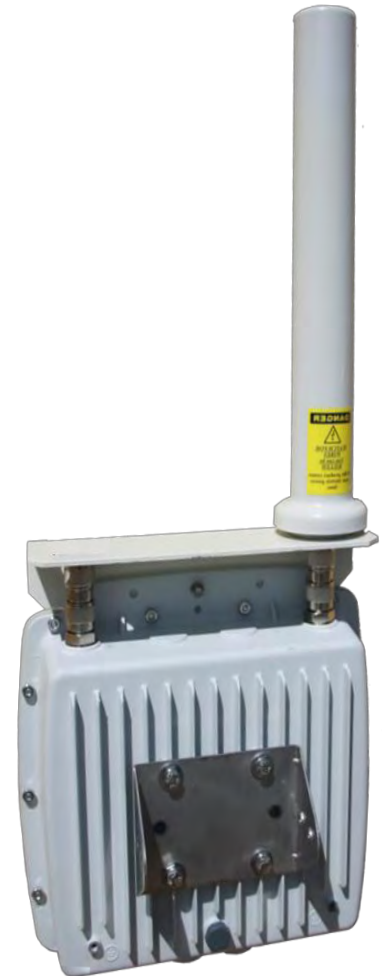
WiMy MVDS IPTV Transmitter with 10 dBi omnidirectional antenna. Sectorial 15-18-21 dB antenna system on request