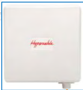
CPE WiMy HD IPTV 18 dB antenna